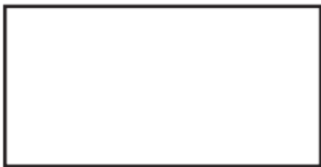
Location of the software operator relative to the site.